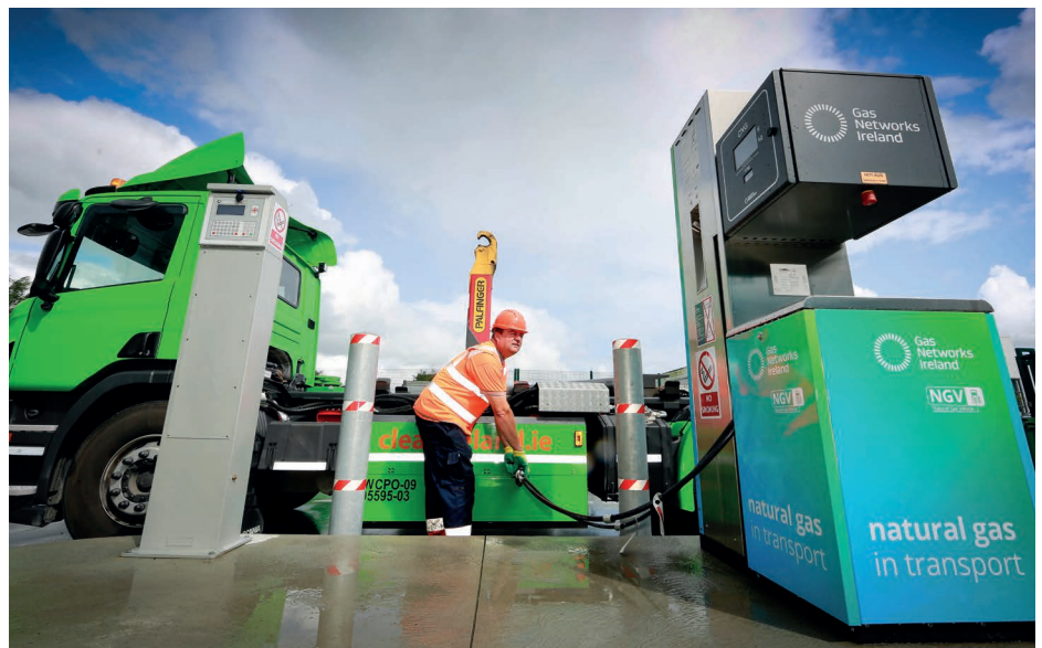
CNG vehicle refuelling at Clean Ireland Recycling, Shannon, Co. Clare